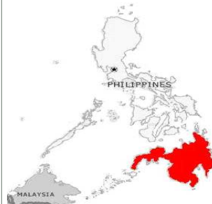
Mindanao location within Philippines

The armed fights have been going on for weeks, amplifying the sufferings of Internally Displaced People (IDPs). At present, more than two hundred thousand people have been displaced and the number of IDPs is constantly been increasing. It is a humanitarian crisis with no signs of mitigating.