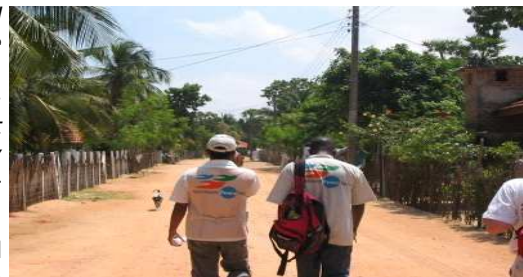
NP Sri Lanka team members patrolling a volatile area in the Eastern part of Sri Lanka

There are between 200,000 and 230,000 internally Displaced People (IDP) in the Vanni region. Consequently, representatives of Sri Lankan civil society issued an appeal to the Government and to the LTTE to guarantee security assurances and basic humanitarian assistance.