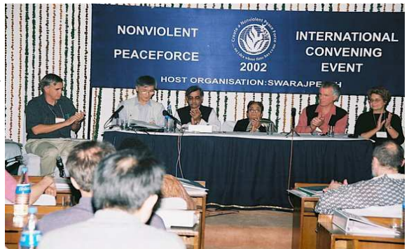
NP International Convening Event in New Delhi

In partnership with local groups, NP members apply proven non-violent strategies to protect human rights, deter violence and help create space for local peace-makers to carry out their work. Launched in 1999 at the Hague Appeal for Peace and established at the convening event in Surajkund, India in 2002, NP brings together over 70 Member Organisations from around the world and is endorsed by 8 Nobel Peace Laureates.