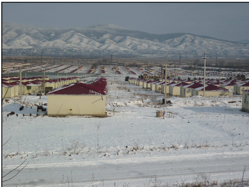
IDPs settlement North of Tbilisi, Georgia.

- Chair of a Georgia-based Multi-ethnic Women Organisation