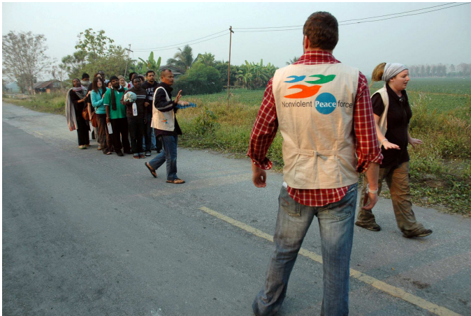
Simulation exercise in Chang Mai, Thailand. Accompanying IDPs.

Nonviolent Peaceforce's intense and substance-packed 10-day Core Mission Preparedness Training (CMPT) concluded successfully on 27 February 2010.