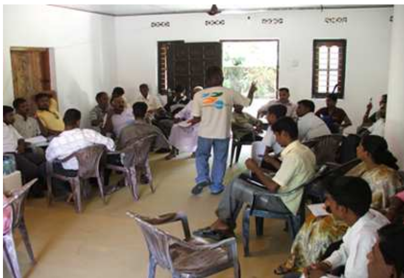
During the group work - NP staff sharing the ideas

The NP team in Batticaloa worked with local human rights defenders and the Batti Peace Committee to help prepare 19 families to complete and file complaints regarding the 'Enforced or Involuntary Disappearance' of family members.